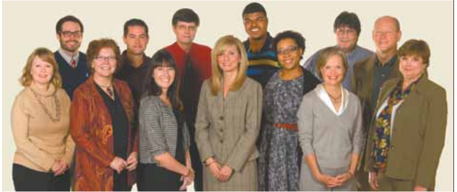
2011 Cenla Boardbuilder Graduates

H aving a successful nonprofit organization means having the right people behind it. Nonprofits are board driven and rely heavily on the leadership of people in their community. Often times, people on boards or newly elected to them have the desire to help but do not always know how to do it. Cenla Boardbuilders is an eight-week training program that helps individuals to be effective board members. The program has seen great success and just graduated its eighth class.